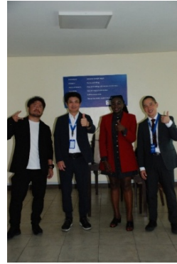
Conducted recruitment interviews on-site in Kenya